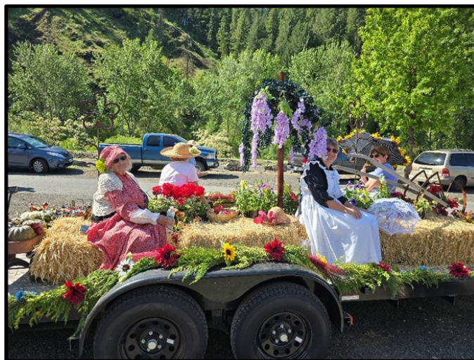
HVGC's winning float at the Locust Blossom Parade